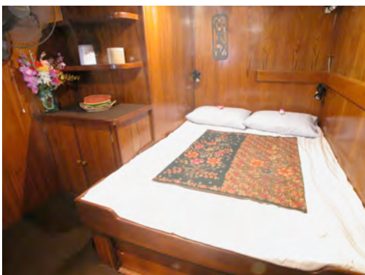
CABIN 3 DOUBLE CABIN MAIN DECK