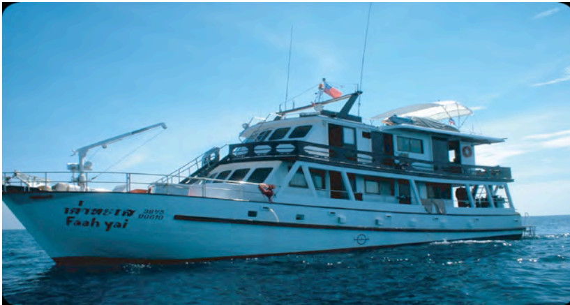
FAAH YAI LIVE-ABOARD CRUISES