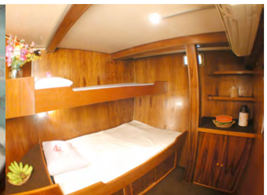
CABIN 4 TWIN CABIN LOWER DECK