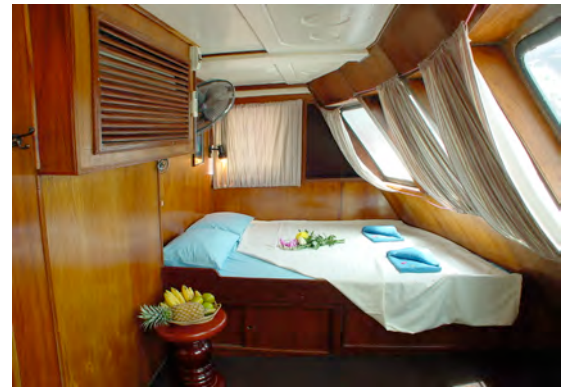
MASTER CABIN FORWARD MAIN DECK